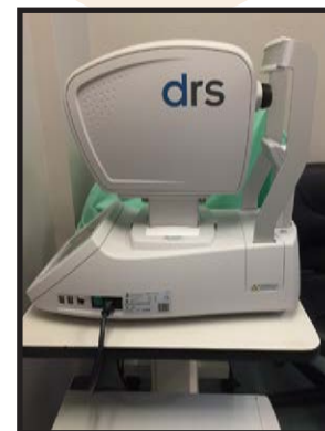
The DRS non mydriatic retinal camera purchased by St. Thomas Community Health Center.