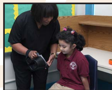
Members of the Southern Eye Bank and Childhood and Family Learning Foundation spend time at the Esperanza School.

Early diagnosis of vision problems will substantially improve the quality of a child’s learning experience as 80% of learning is visual. Can glasses lead to better behavior? If you can see the board, you are more likely to retain the information and remain engaged.