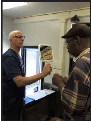
Local resident receiving eye glasses.

Southern Eye Bank is pleased to announce that Vision Service Plan’s Mobile Vision Bus was a huge success. We are truly grateful for the opportunity to host VSP again and look forward to bringing eye care to those who would otherwise not be able to afford it.